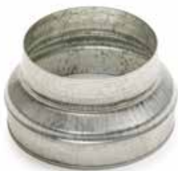
Réduction Conique Concentrique

The RCC joins two galvanised ducts of different diameters together.