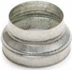
Réduction Conique Concentrique

The RCC joins two galvanised ducts of different diameters together.