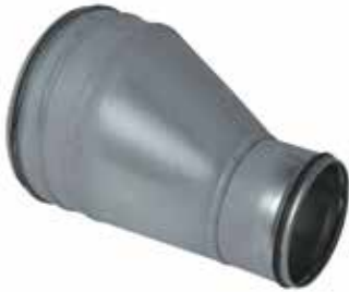
Offset Conical Reducer

The sealed RCE concentric conical reducer is used to join two galvanised ducts of different diameters together while delivering class C airtight performance.