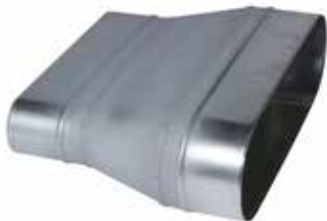
Oblong Concentric Reducer

The RCO oblong concentric reducer joins two galvanised ducts of different diameters together.