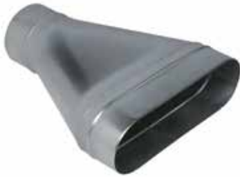
Oblong Cylindrical Concentric Reducer

The RCOC oblong / circular concentric reducer connects an oblong duct to a circular duct.