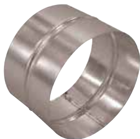
Raccord Femelle en aluminium

The RF aluminium female connector connects two aluminium accessories together.