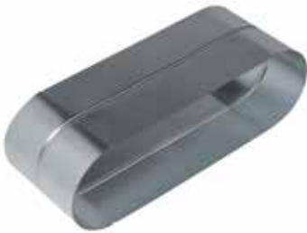
Raccord Femelle Oblong

The RFO oblong female connector connects two galvanised oblong accessories together.