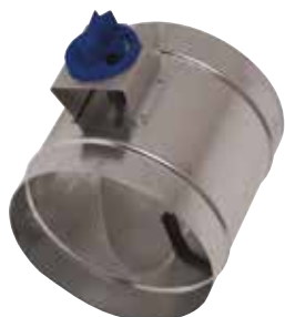
Registre d'Equilibrage en aluminium

The aluminium balancing damper is used to adjust the pressure in aluminium ducting branches in commercial or multi-occupancy residential buildings.