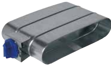
Oblong Balancing Damper

The RGO oblong balancing damper is used to adjust the pressure in oblong ducting branches in commercial or multi-occupancy residential buildings.