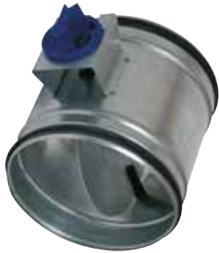
Registre d'Equilibrage Perforé en aluminium

The aluminium balancing damper is used to adjust the pressure in aluminium ducting branches in commercial or multi-occupancy residential buildings.