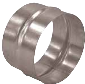
Raccord Mâle en aluminium

The RM aluminium male connector connects two aluminium ducts together.