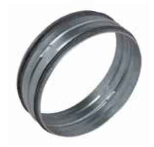
Sealed male connector

The sealed male connector is used to join two galvanised ducts together while delivering class C airtight performance.