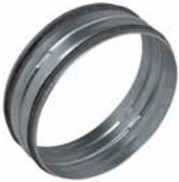
Sealed male connector

The sealed male connector is used to join two galvanised ducts together while delivering class C airtight performance.