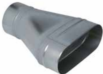
Oblong Tangent Cylindrical Reducer on flat section:

The ROCTP oblong cylindrical tangent reducer is used to connect an oblong duct with a circular duct while maintaining a linear and flat ducting without losing space underneath.