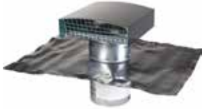
Standard roof outlet

The standard roof outlet was designed for CMEV and air handling systems in multi-occupancy residential and commercial buildings.