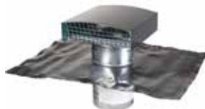
Standard roof outlet

The standard roof outlet was designed for CMEV and air handling systems in multi-occupancy residential and commercial buildings.