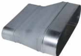
Oblong Tangent Reducer on flat section:

The ROTP oblong tangent reducer is used to connect oblong ducts of different diameters while maintaining a linear and flat ducting without losing space underneath.