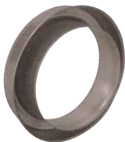
Réduction Plate Concentrique en aluminium

The RPC aluminium joins two aluminium ducts of different diameters together over a minimum length.