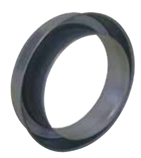
Réduction Plate Concentrique

The RPC joins two galvanised ducts of different diameters together over a minimum length.