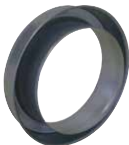
Réduction Plate Concentrique

The RPC joins two galvanised ducts of different diameters together over a minimum length.