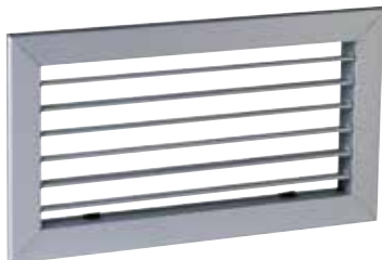
Grille SC 101

The SC 101 steel wall grille enables air extraction on all ventilation and air-conditioning systems.