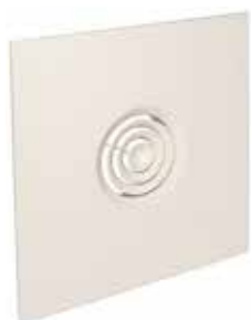
SC 832 TP F0 D200 (AxB=600x600)

The SC 832 TP is a steel concentric horizontal fixed air diffuser, designed to replace a standard ceiling tile.