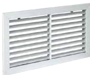
Grille SC 121

The SC 121 steel wall grille enables air extraction on all ventilation and air-conditioning systems.