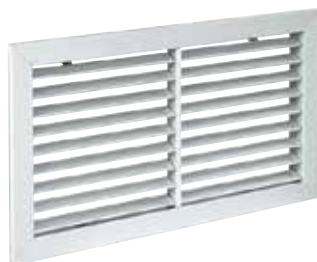
Grille SC 121

The SC 121 steel wall grille enables air extraction on all ventilation and air-conditioning systems.