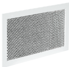
SC125 F3 300X300

The SC 125 slotted grille offers discreet aesthetics for air extraction in ventilation or air-conditioning systems.