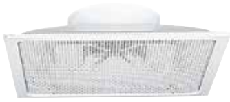
SC319R F16 D160 300x300

The SC 319 R is a slotted plate square diffuser for extraction.