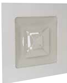
Diffuser SC 369R

The SC 369 R is a slotted plate square diffuser for extraction.