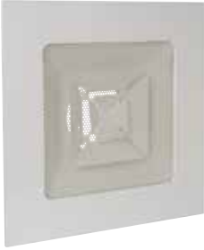
SC360RIF(5)F16 D250 AxB=600x600 c66.5

The SC 310 R is a square slotted opening diffuser, operating in up to 4 directions, for standard ceiling tile.