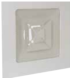
Diffuser SC 369R