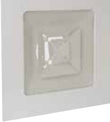
Diffuser SC 369R