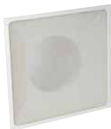
SC 370 return air grille

The SC 370 ceiling grille offers discreet aesthetics for air extraction in ventilation or air-conditioning systems.