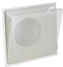
SC370W3 FO 598x598

The SC 370 ceiling grille offers discreet aesthetics for air extraction in ventilation or air-conditioning systems.