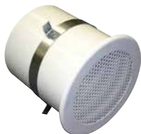
SCR 125 F14 D 200

The SCR 125 is a supply or return terminal specially designed for the prison sector and psychiatric institutions.