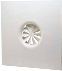
SF 861 T F0 D250 AxB=600x600 (c25)

The SF 861 T is a fixed swirl jet ceiling diffuser for air diffusion in commercial buildings.