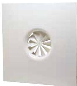
SF 861 T F0 D315 AxB=600x600 (c31)

The SF 861 T is a fixed swirl jet ceiling diffuser for air diffusion in commercial buildings.