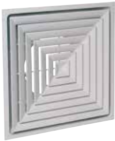
SF704RIF(5) TP F16 D250 (AxB=600x600)

The SF 704 R TP is a square ceiling diffuser with 4 air diffusion directions and a built-in plenum for use in commercial buildings.