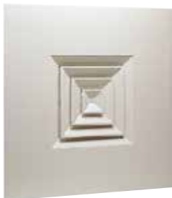
Diffuser SF 704TP

The SF 704 TP is a square ceiling diffuser for ceiling tiles with 4 air diffusion directions, for use in commercial buildings.