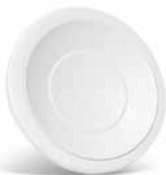
SR 145 D125

The SR 145 steel core terminal with on-site adjustable airflow is used for air supply.