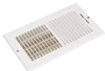
SR 356 F1 203X102

The SR 356 pressed wall grille is used for air supply. It features a damper to adjust the airflow.