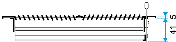
Grille SR 356