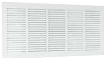
SR 377 F1 200X100

The SR 377 pressed wall grille is used for air extraction.