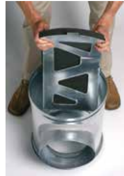
Installation du détecteur acoustique et aéraulique dans le caisson piquage