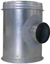
Caisson Piquage Acoustique et Aéraulique pour relevé

The CPT2A branch connector provides a junction and accessibility to the vertical collector system and horizontal ducting, improves acoustic and aeraulic performance.