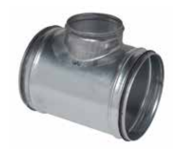
Right-angle T-piece + seal

The right-angle T-piece with seal is used to connected two galvanised ducts at a 90° angle while delivering class C airtight performance.