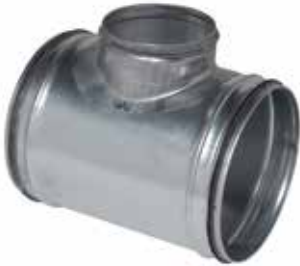
Right-angle T-piece + seal

The right-angle T-piece with seal is used to connected two galvanised ducts at a 90° angle while delivering class C airtight performance.