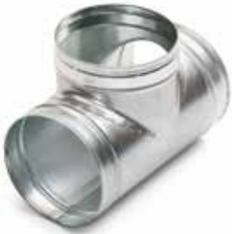
Té Equerre 90°

The TE 90° T-piece is used to connect two ductwork branches at an angle of 90°.