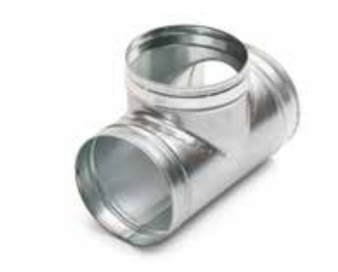
Té Equerre 90°

The TE 90° T-piece is used to connect two ductwork branches at an angle of 90°.