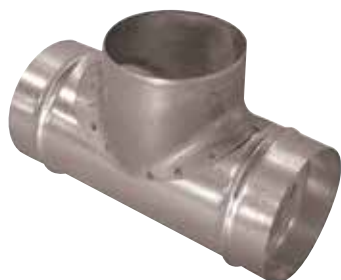
Té Equerre 90° en aluminium

The TE 90° Alu T-piece is used to connect two aluminium ductwork branches at an angle of 90°.