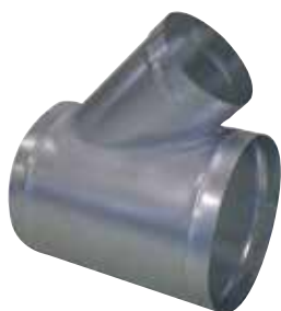
Té Oblique 45°

The TE 45° T-piece is used to connect two ductwork branches at an angle of 45°.