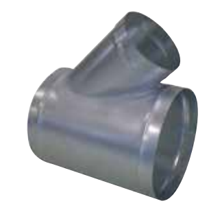
Té Oblique 45°

The TE 45° T-piece is used to connect two ductwork branches at an angle of 45°.