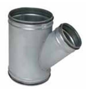
Angled T-piece with seal

The 45° branch piece with seal is used to connected two galvanised ducts at a 45° angle while delivering class C airtight performance.